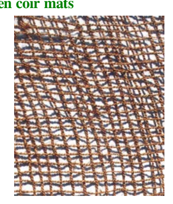
Woven mattress coir mat