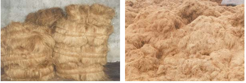
Bristle coir fiber