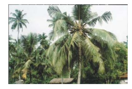
Plate 1: Coconut trees

The traditional way of processing coir starts with curing the coconut husks in water for 6-7 months. Large curing pits are generally used and husks are added in one end and the cured husks are retrieved from the other end. Curing of husks in water increases the flexibility of coir fibers and also has